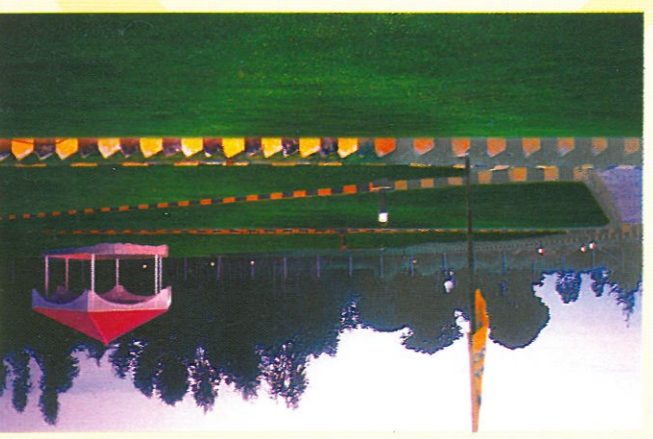
CANARA Residency Real Photographs